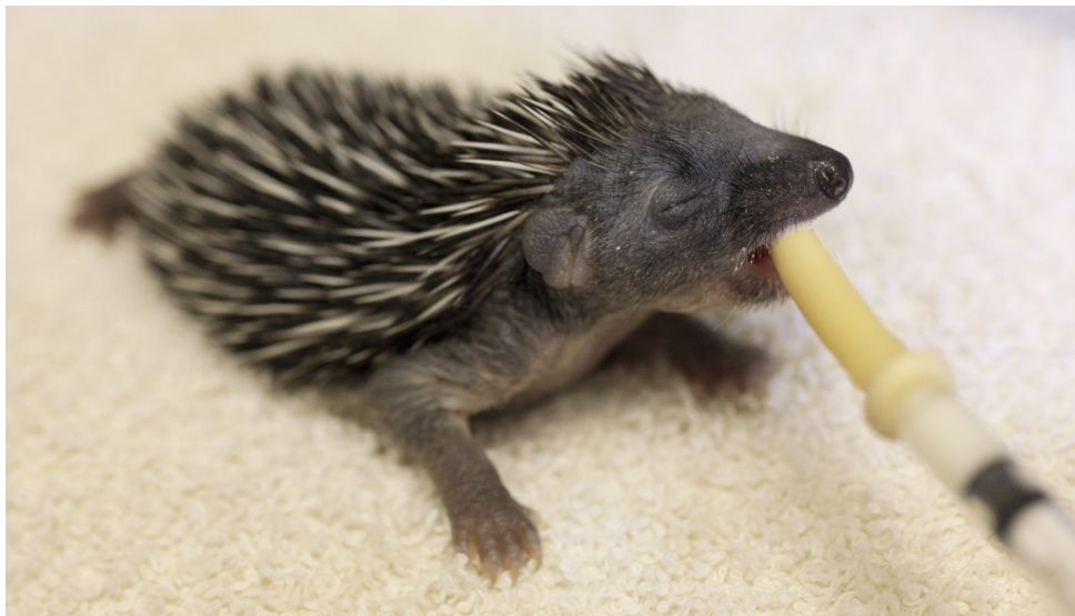
Single hoglet being hand fed at Stapeley, UK.

Collaboration and information sharing should be utilised in this process, with guidance and model templates already in use by other AWEs and the local authority. Those establishments not able to prove that their policies comply with the Animal Welfare Act should be denied a licence and either encouraged to reach the standards required within a specified time period or to close. Help should be offered to those organisations below standard and who wish to upgrade to improve, perhaps through support from nominated organisations recorded on a list of experts such as the RSPCA. 27