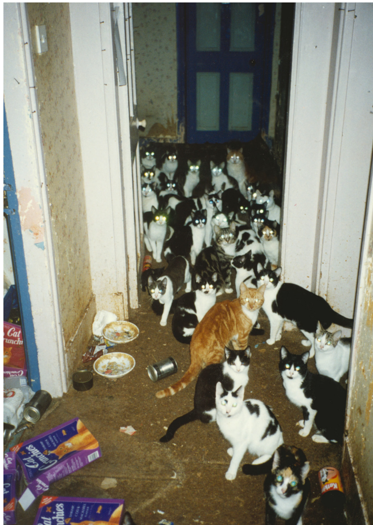
70 cats kept in a house

Those individuals in a similar situation who are 'holding themselves out to the public' to receive animals however, should be covered by proposed regulation. It is unlikely individuals in this situation would be able to meet the requirements of any such regulation and consequently the welfare needs of the animals in their care, in which case regulation would act to protect them from their own good intentions.