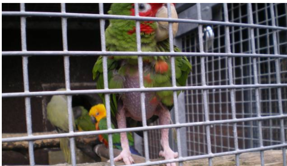
Self-plucked mitred conure in sanctuary, UK